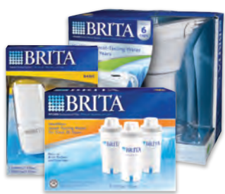
water filtration systems and filters